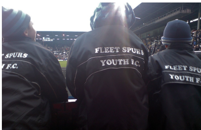
Away from their own pitch, the Under 8's prepare for a pitch invasion at Craven Cottage.

Fleet Spurs Youth are having an excellent season to date, with the two non-divisional Under 8s teams, the Meteors and Comets , improving weekly and results going in the right direction.