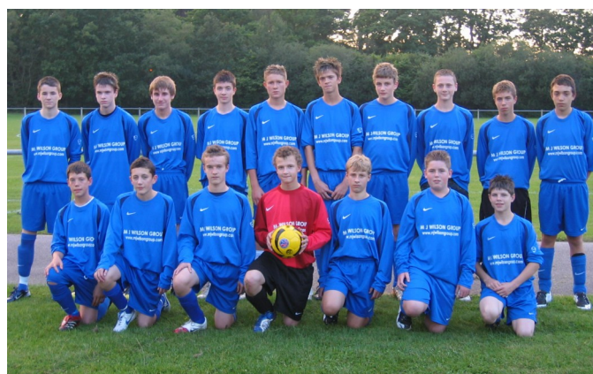
U15's aiming for the top spot in Division 1.

At Under 15s FSY field two teams, the main U15s team is riding high at the top of Division 1, and though the Saxons are having a tough time battling for points in division 3, they were bolstered this week with a great victory over Hook United Hammers.