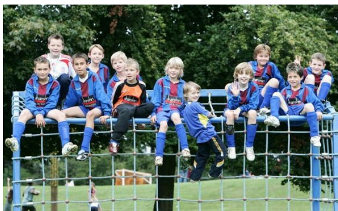
U10 FS Boca, on top of the world.

At Under 10s FSY field 4 teams, The U10 FS Boca are in 2nd place in division 2 and are through to the semi-finals of the League Cup, a match which is currently scheduled for March 1st, so if you aren't busy on that particular Saturday morning make your way to Oakley Park and add your support. After being at the top of division 3 for some time the FS Royals are now hovering mid-table but are intent on climbing back to where they belong and although FS Porto , and the FS Magpies aren't enjoying divisional success the general improvement in both teams is evident, and the boys are enjoying their Saturday morning football, which is the most important thing of all.